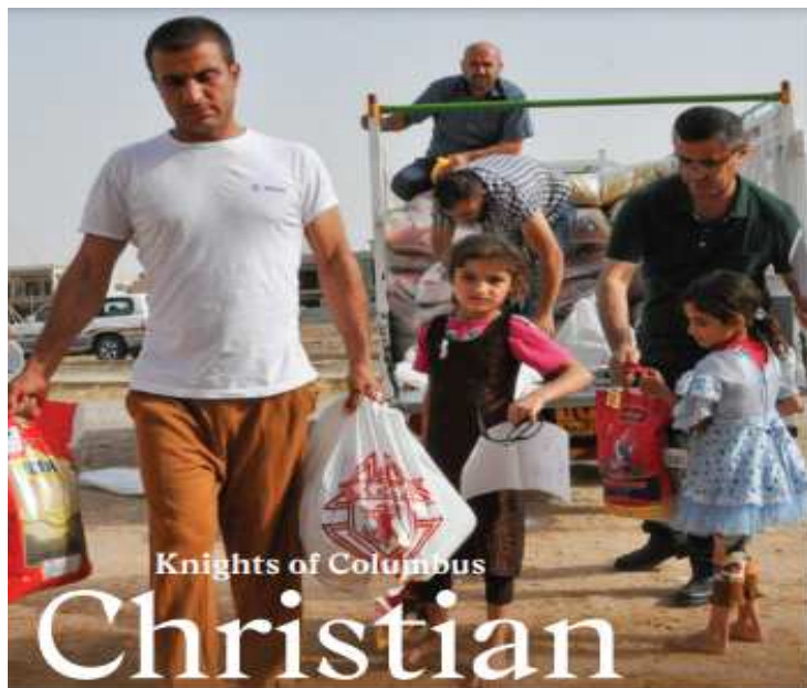
Knights of Columbus

Columbus Hall is the home of Knights of Columbus Council #788 517-321-2209