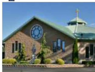
Our Lady of Fatima Parish Saturday, October 4th, 2025